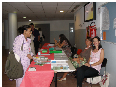
Attendees of the 2010 Regional Meeting

Padua University is not only one of Europe's oldest places of higher learning but also an institution with a long-standing international tradition. As the publication of innumerable conferences and congresses show, the modern-day University of Padua plays an important role in scholarly and scientific research at both in Europe and worldwide.