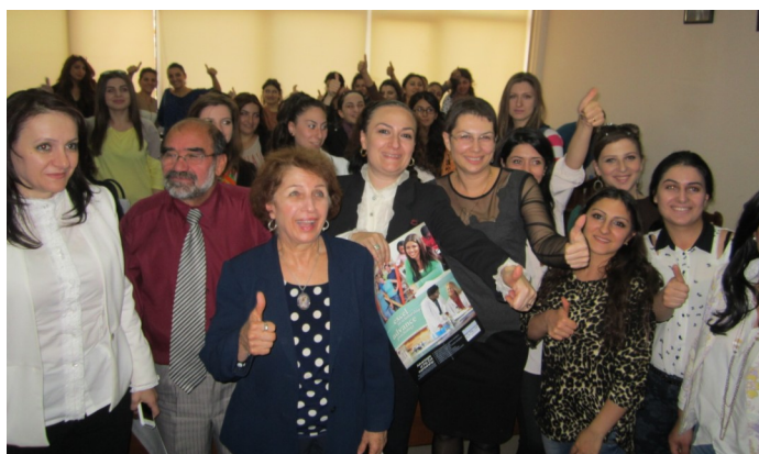
PHOTO 2. At Abovyan Pedagogical University, faculty and students give a thumbs-up for international cooperation among psychologists.